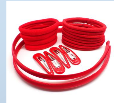
Red, simple hair accessories