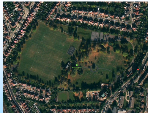
King Edward VII Park