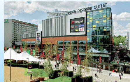
London Designer Outlet