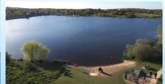
Welsh Harp Reservoir